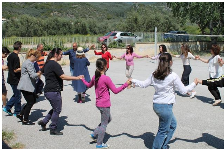
welcome dance in the school yard with students, teachers and parents