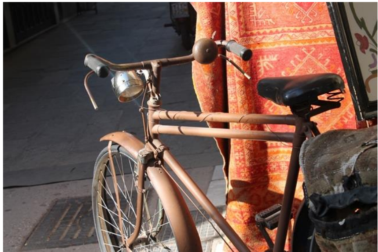
A bicycle in Athens