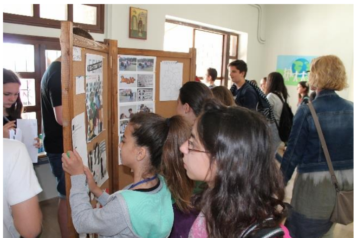
students choose best practices of fine art works from all participating schools