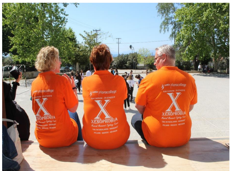
Lentiz teachers' team allready prepared to go on tour