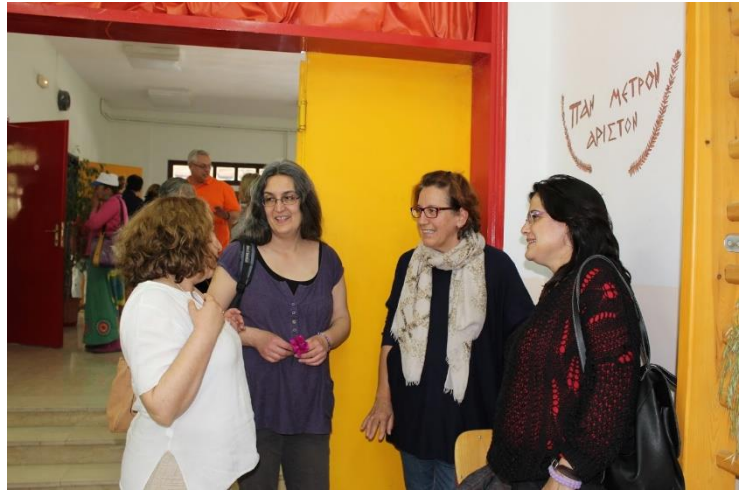
final presentation, mothers