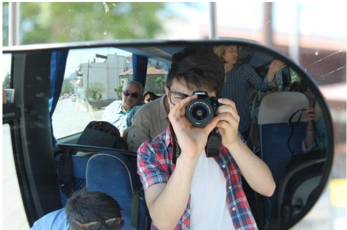
bus tour to Meteora