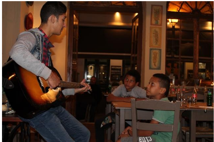
during our last common dinner there was a a chance encounter of the musical kind