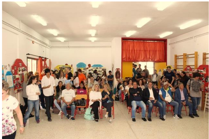
final presentation, the audience