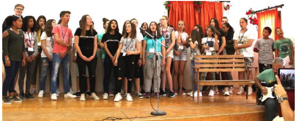
international students' choir singing the song of the Greek musical scene