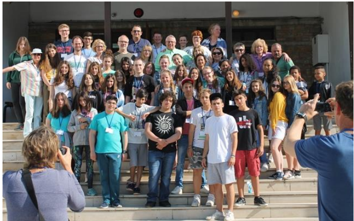
the international group getting used to photographers