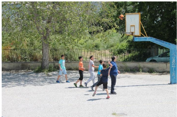
boys playing basketball in the school yard