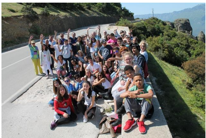
the group at Meteora