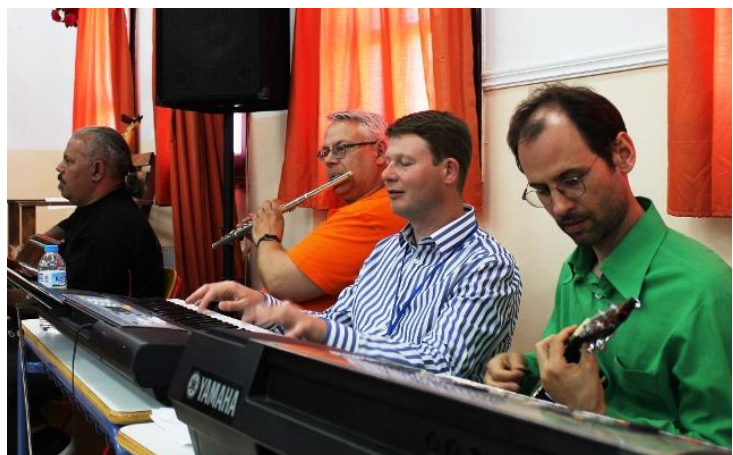
instrumental support by teachers from all participating schools