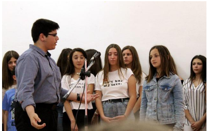
Kato Lehonian students' choir is presenting a musical scene about Xenophobia