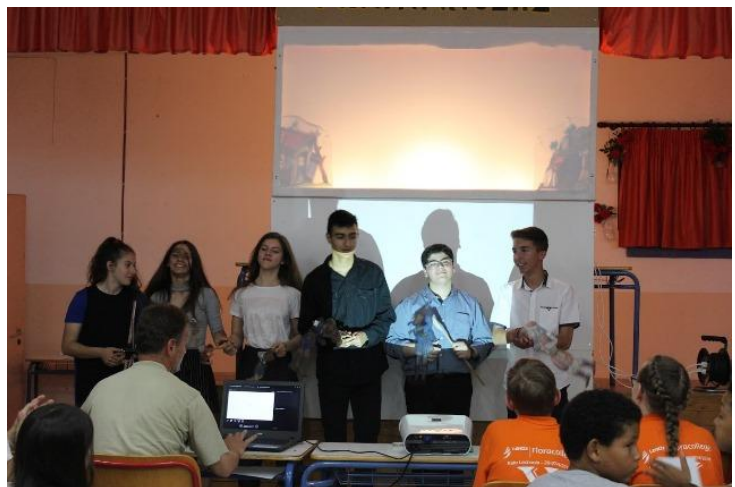
shadow theatre group