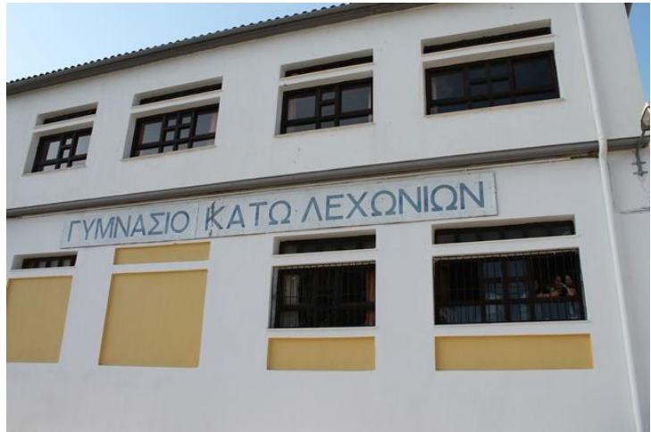
the school building in Kato Lehonion