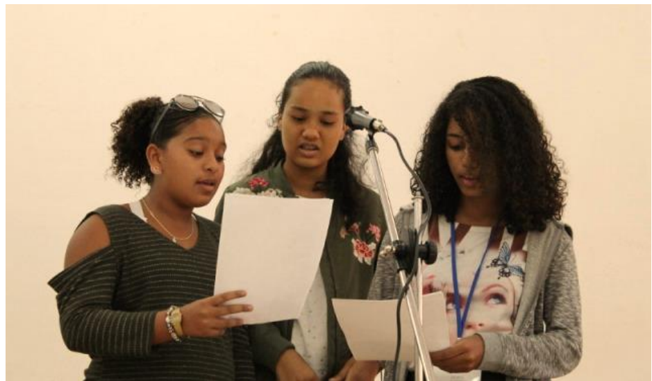
vocal trio of Collège Henri Matisse